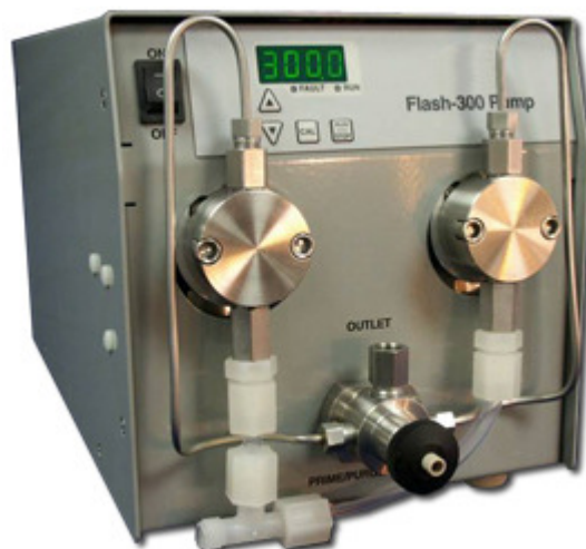
SFT-Flash 300 High Flow Pump