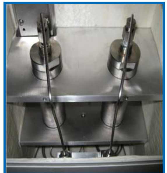
Inside of SFT-110XW SFE with (2) 100 ml Vessels ►