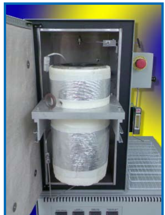
SFT-250 SFE System with 2 liter Vessel ▲